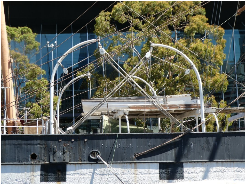
The falls as they are now.