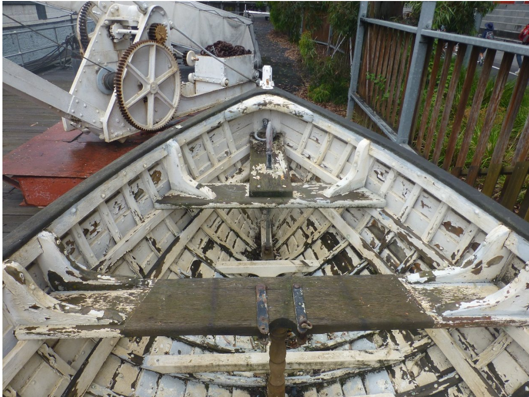
The Bow section