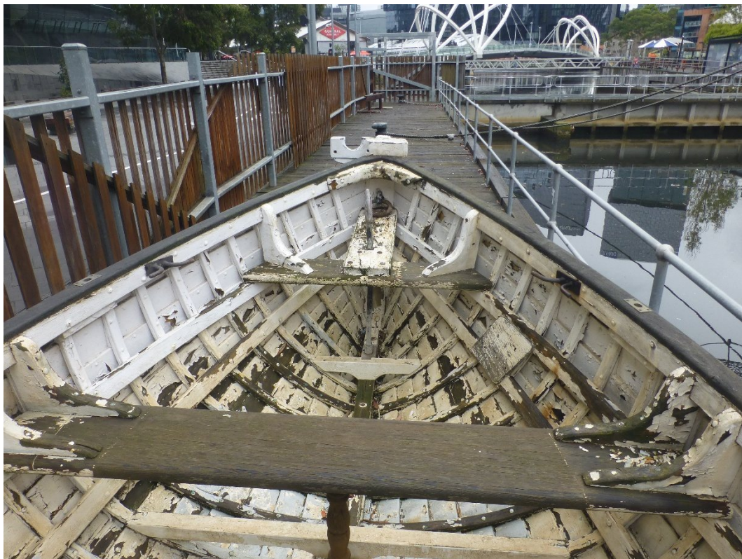
The Stern Section

Volunteers are required to assist in restoring boat No.1, then guess what!. boat No.2.