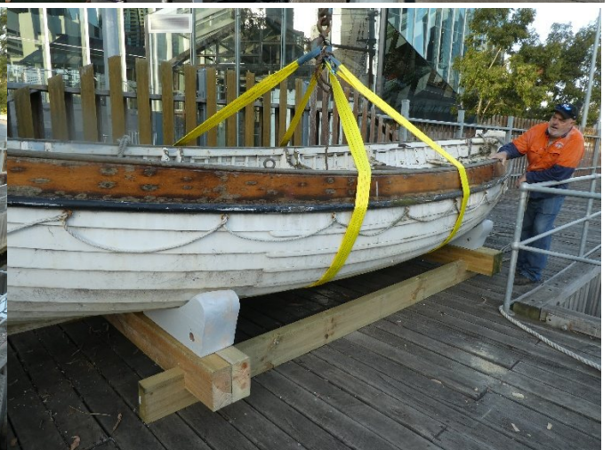
Top - Setting up fenders.