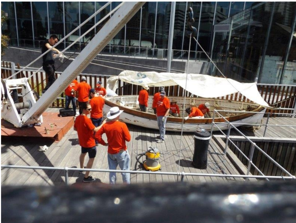
Exxon Mobil volunteers with ship's port boat