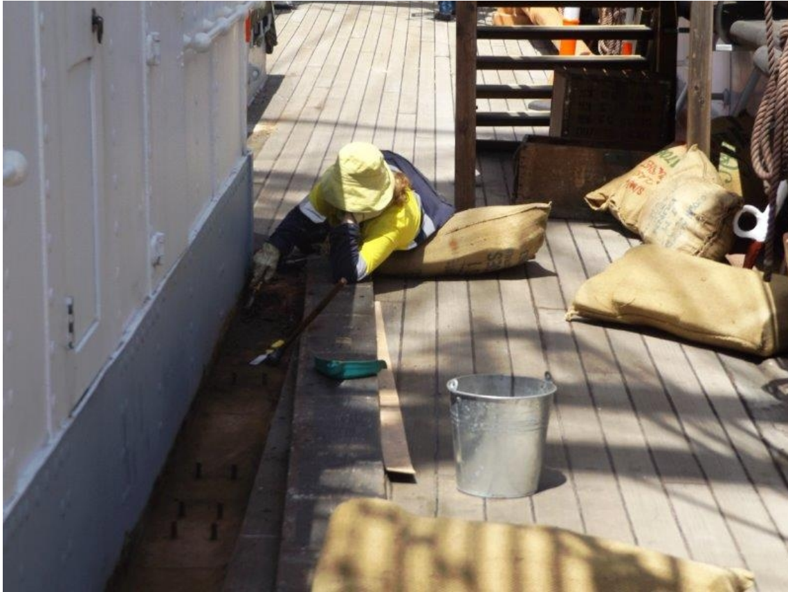
Preparing for the margin boards